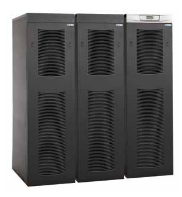
20-30 kVA 208V UL 924 UPS